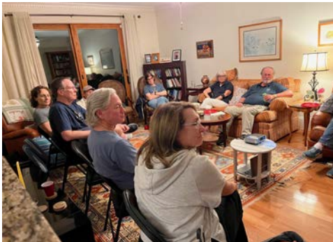
...When we watched the Coen Brothers' A Serious Man for our first Jewish Movie Night on September 14th. The Blau's living room was full, and we all enjoyed the movie and the conversation that followed. Watch for the announcement of Jewish Movie Night #2, coming soon to a living room near you!