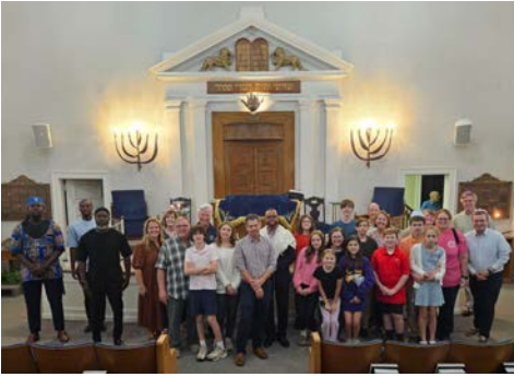
...When children, teens and adults from the Myers Memorial United Methodist Church joined us for Shabbat services on September 20th.