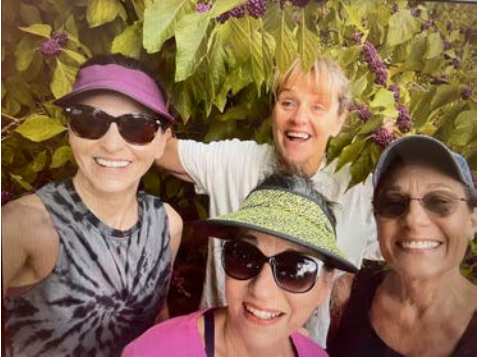
...When our recently-formed Women's Club hiked on Sunday morning, September 15th, on the Seven Oaks Preserve Trail in Belmont. In fact, it was so much fun that we'll be hiking there on the 4th Sunday of every month! Join us!